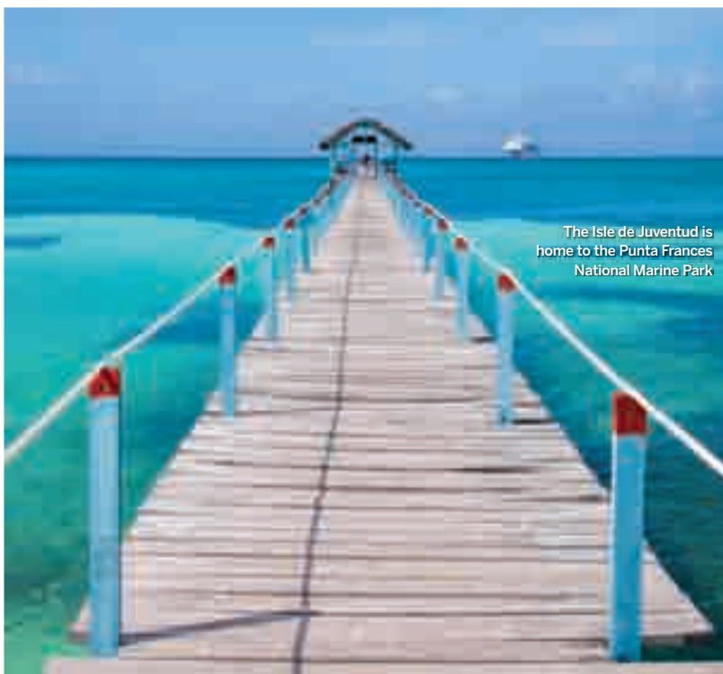
The Isle de Juventud is home to the Punta Frances National Marine Park

► benefit from these reforms. Now he runs a beautiful Cuban B&B in his family's 1800-vintage mansion, along with horse riding excursions, horse-whispering classes and street photography tours. The Island Sky continues east past the Ancón beach peninsula and the ancient port of Casilda from where Spanish conqueror Hernán Cortés sailed for Mexico in 1518. As she cruises beneath the bulging southern coastline of Cuba, she weaves through the island's most outstanding coral archipelago – the protected Gardens of the Queen (Jardines de la Reina). These 250 tiny, uninhabited virginal coral atolls are sprinkled across perfect turquoise seas and fringed by red mangrove where turtles, dolphins, whale sharks and goliath groupers swim.